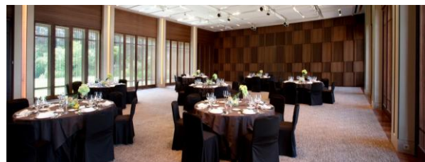
Yeong Bin Gwan