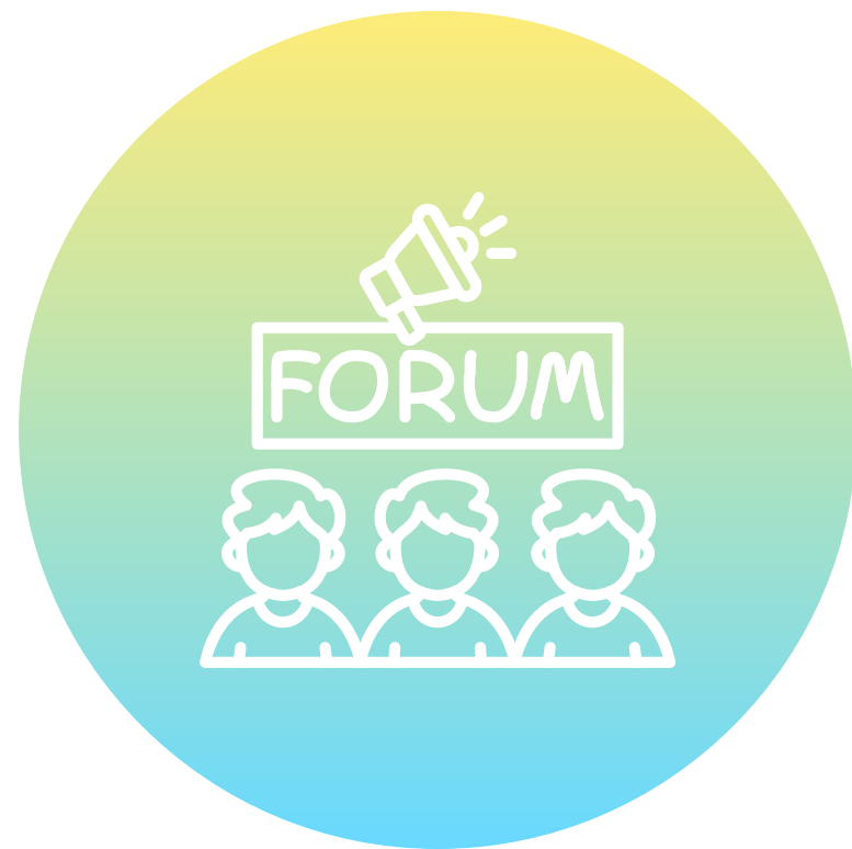
Asia-Europe Youth Forum